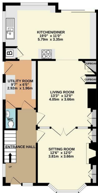
GROUND FLOOR 633 sq.ft. (58.8 sq.m.) approx.